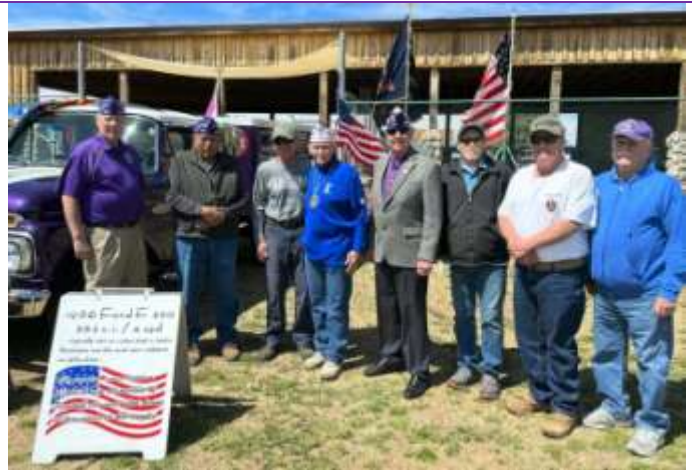
photo next page